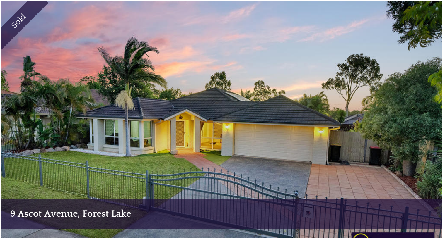
9 Ascot Avenue, Forest Lake