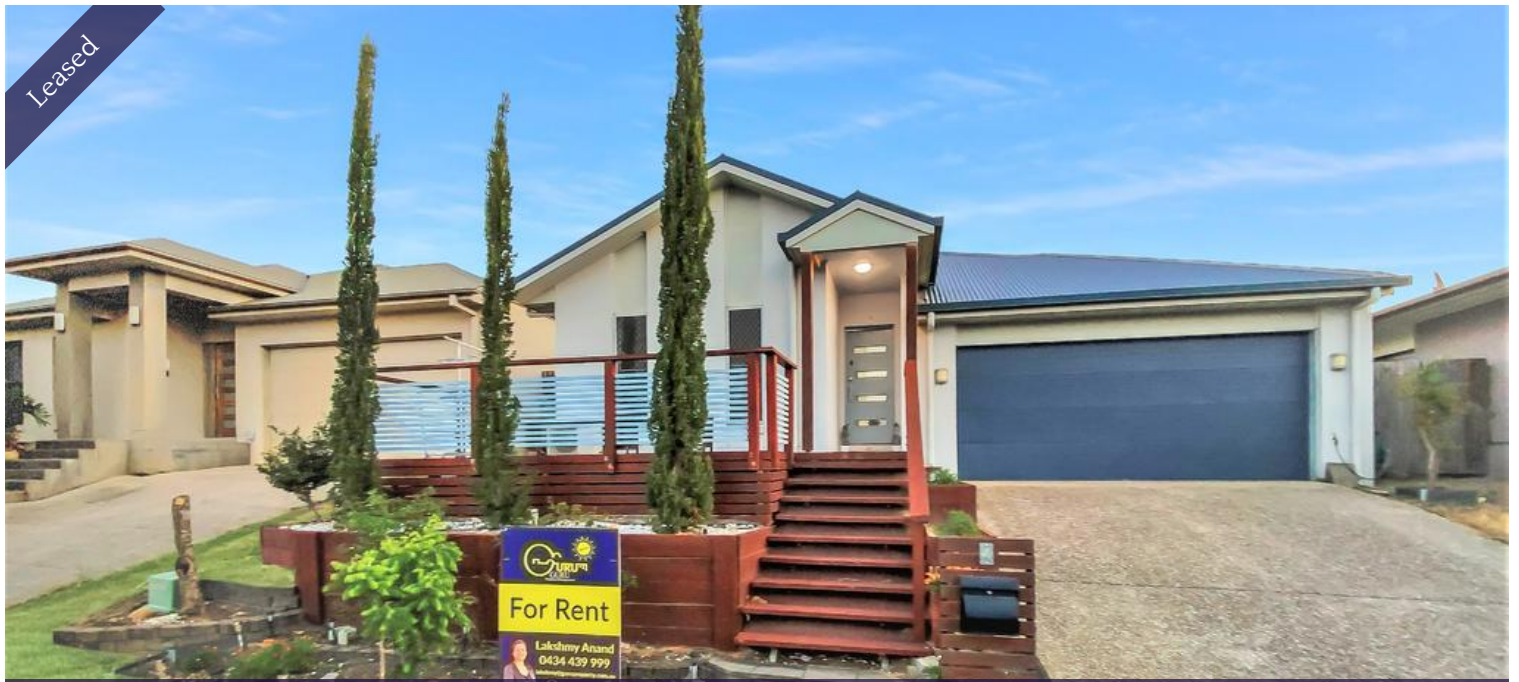
4 Riverine Dr, Springfield Lakes